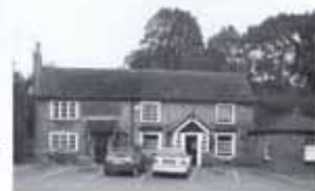
The Royal Oak.

On Robin Hood Road, opposite the car park of 'The Forge', is a locally listed house called Nuthurst.