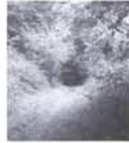
Sandybit Lane, looking down the hill towards Chobham Road.

After a short distance there is a path on the right. Take this path, with Hill Place on your right and the Golf Course on your left. This path eventually