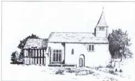
Bisley Church before 1873.

are made of various local stones – including 'sarson stones' (a hard sandstone found on the local heaths) and 'pudding-stone' (which looks like dark brown concrete, but is a natural material sometimes found at the base of deposits of sand as a kind of 'pan').