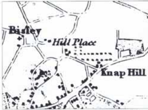
Hill Place in the mid-18th century.