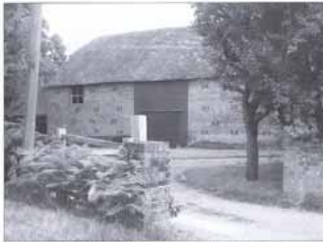
Whitfield Court Barn.

Whitfield Court Barn Whitfield Court Barn dates from the 18th century, with 19th-century brick extensions to the south and north. Together with the house, it is a Grade II listed building.