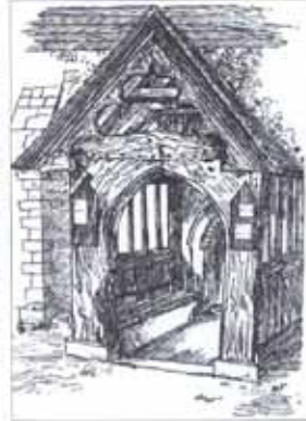
The porch of Bisley Church