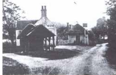
The 'Barley Mow' - in the days when it was still a public house.

It has been claimed that the house was once a royal hunting lodge to Windsor Forest. A fire-back in an Inglenook Fireplace bears the coat of arms of Charles I and the date 1635 - one of the only other known examples being at Windsor Castle itself! In the early 19th century, when it was a public house, it was valued, together with the 'Sun Inn' at Chobham and 340 acres of land, at £350. The pub closed in 1921 and the property was converted back into a