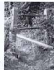
The 'worst stile on the walk'.

tree) and enter the field. Walk along the side of the field with the hedge immediately on your right, until you reach the bottom corner where you will find one of the worst stiles on the walk! It might not look too difficult from this angle, but wait until you try to get down the other side! Continue along the path at the bottom of the field until you reach the gate and stile that take you into Kile Lane.