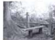
The stile into the field.

On your left, beside the entrance to Ringstone Farm, is a footpath. Take this path, up the hill, until you see a stile on your right. Cross the stile (or walk around the side, by the