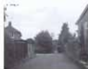
The footpath to Waterer's Park.

A footpath on the right leads to the children's playground on Waterer's Park and so back to the car park at the top of the hill.