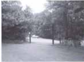
Waterer's Park car park.