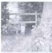
The stile on to the Golf Course.

This stile takes you on to the Chobham Golf Course. Follow the marked path around the edge of the course to Sandpit Lane which is an ancient bridleway.