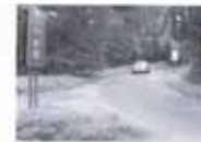
Junction with Warbury Lane.

Cross Chobham Road at the junction with Warbury Lane and walk along the lane to the point where it becomes a one-way road.